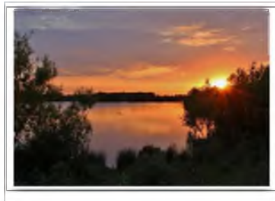
Sunset over Ferry Lagoon – Lisa White

There is also good botanical news with grass-poly, a species of flowering plant that is endangered in the UK, once again being present on the dry ground of Ferry Mere.